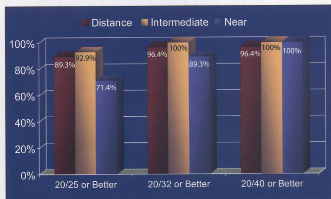
Figure 1. Binocular uncorrected distance and intermediate and near visual acuity with the Crystalens. n=28

Complications Management. Complications can occur with any procedure, and Crystalens implantation